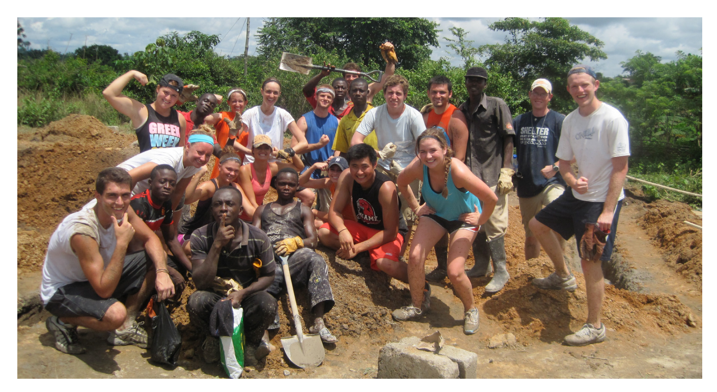
As a group we worked together to make the designs for the teacher's cottage become a reality for the village. We started off as strangers and grew closer as the weeks progressed, ending the month long journey as close friends we will never forget.