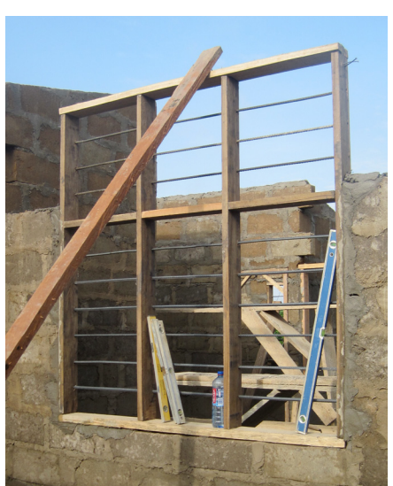
The process began with designing the housing. There it progressed from digging and laying the foundations to building up the floor, walls and windows. When the vertical planes were complete it was time to add the roof and shading devices onto the house.