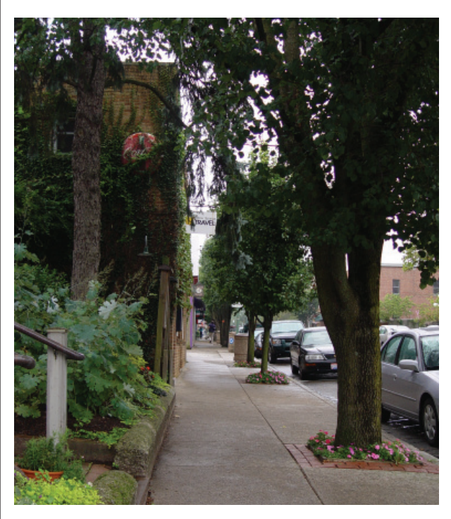
Studies have shown that people drive slower on treelined streets.

Universal design has much in common with the livable community and aging in place initiatives. But, universal