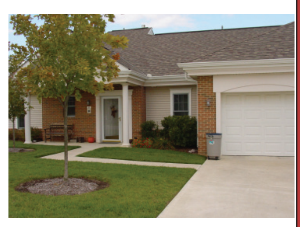
Universally designed homes are built without stairs.

The concept of livable communities is related to similar initiatives both for individual dwellings and community-wide - launched over the past 30 years or so (e.g., "universal design," "smart growth," and "aging in place"), and incorporates certain elements of all. The major components of livable communities - all of which should be preceded by the crucial modifier "accessible" - include: safety and security; housing; home modification and adaptive equipment & technology (e.g., ramps, handrails, easy access bathtubs); transportation; health care services; supportive in-home and community services; recreational, cultural, and lifelong learning, and employment/volunteer opportunities aimed at fully engaging the bodies, minds and spirits of older persons, ensuring that they are fully included in their communities and tapped as the vital resources that they are.