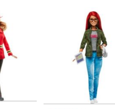
**** (6) Barbie® Careers Game Developer Doll