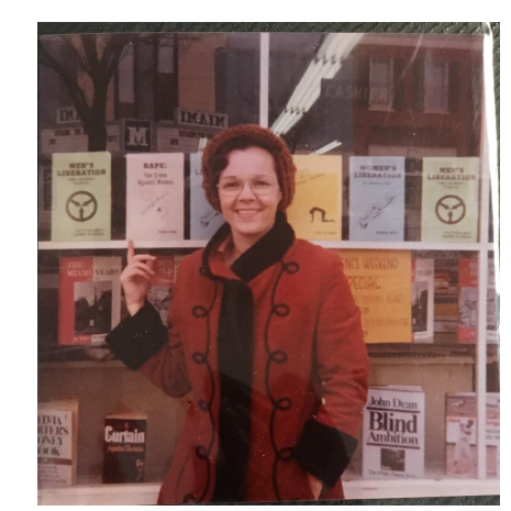
Why did you think I couldn't get published?