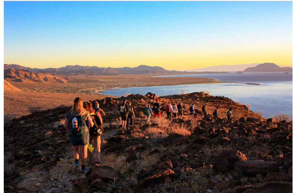
Project Dragonfly students on a study abroad trip in Mexico